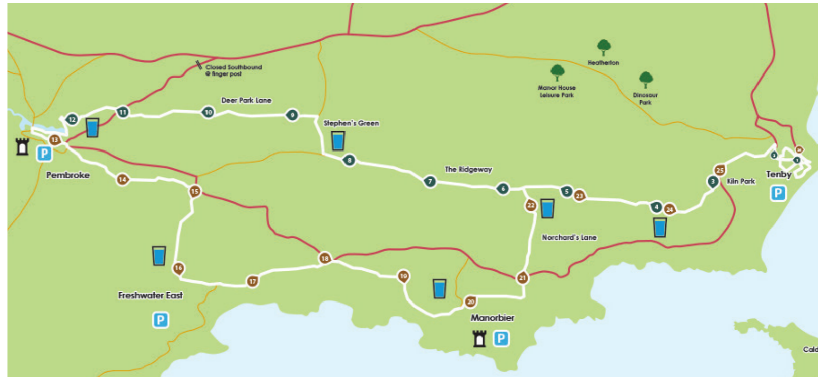
Image: The Oakwood Wales Full & Half Marathon route for 2015